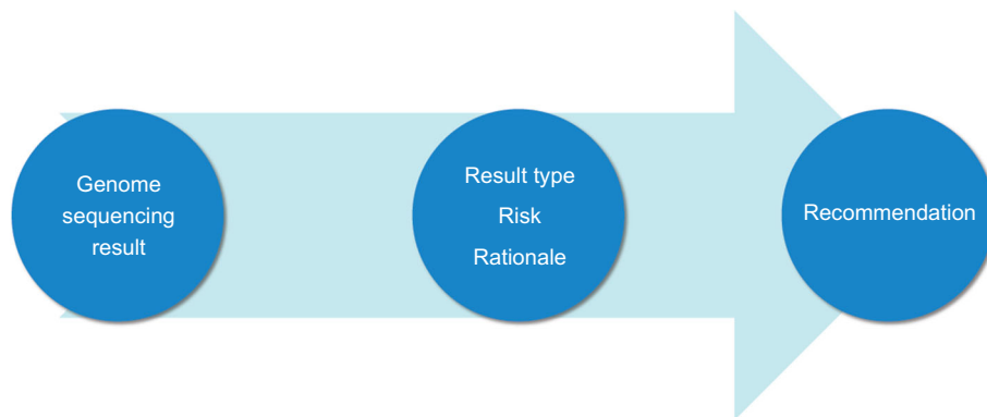
Figure 1 Conceptual framework for summative content analysis of PCP–patient discussions about genome sequencing results. For each result discussed, one or more take-home messages, or recommendations, were identified. The discussion about each recommendation was further coded by the type of result (e.g. monogenic disease risk, carrier status, polygenic risk, or pharmacogenetic result), the risk the PCP ascribed to that result, and the rationale(s) given for the recommendation.

Through this process, we inductively developed the conceptual model shown in Figure 1. We found that PCPs generally guided their patients through each section of the genome report in order, discussing each result, its potential health impact, and the PCP's recommendations, if any. For each individual genome sequencing result (e.g. a polygenic risk estimate for coronary artery disease or a carrier status for a rare autosomal recessive condition, biotinidase deficiency), we sought to identify the one or more take-home messages the PCP communicated to the patient about that result, which we coded as the recommendation(s) . We then examined the explanation the PCP gave for each recommendation. We found that this